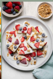
FROZEN YOGURT BARK