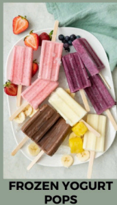
FROZEN YOGURT POPS